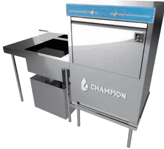
標準式運作圖 Standard Type Operation